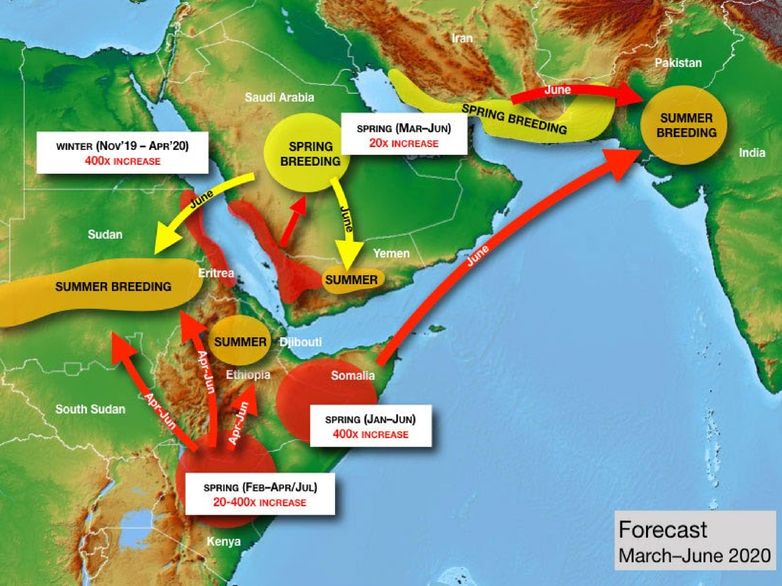
Forecast March–June 2020